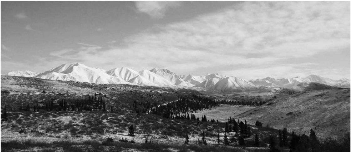
Figure 3. View looking to the northwest (top) and northeast (bottom) from an autumn observation site near Lost Creek on the southern slopes of the Mentasta Mountains, October 2014. In autumn, most Golden Eagles were detected as they migrated along the higher ridges of the Mentasta Mountains to the north of the observation site.

low along slopes or circling low over the landscape) and 91 appeared to be primarily intent on migrating. We did not observe any white feathering on most of the eagles we detected in spring 2014.