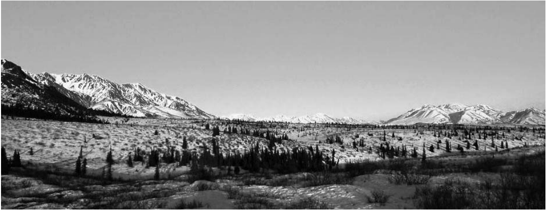
Figure 2. View looking east from a spring observation site near Rock Creek on the southern slope of the Mentasta Mountains, March 2014. In spring, migrating Golden Eagles were detected across a broad front, from the Mentasta Mountains to the north (left side of photo) to the Boyden Hills to the south (right side of photo).

capture work (5 d from an east-facing blind, 17–21 March, and 5 d from a west-facing blind, 23–27 March), and while we dismantled our field camp and trapping sites (1 d; 28 March).